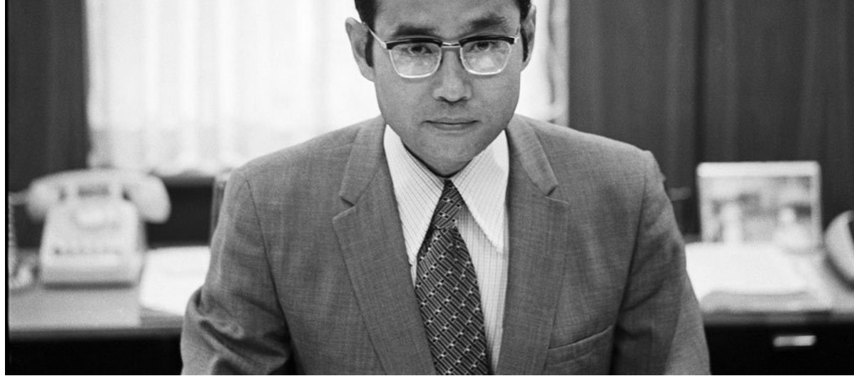
In recognition of Black History Month, Mendoza's Staff Diversity Equity & Inclusion Council's subcommittees on Engagement and Education and Culture and Inclusivity will be sharing stories in Mendoza Morning Brew.